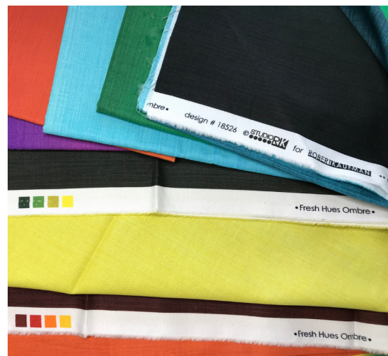
Fresh Hues Ombre, by Studio RK (Robert Kaufman)

I also purchased one yard cuts of: Sunburst 209 & Celestial 325. I hardly used the Sunburst, so could have gotten away with a half yard. Happy to have the yard-length of Celestial, as it came in handy for the borders. Refer to the pattern for more information on dimensions, and for the pieces.